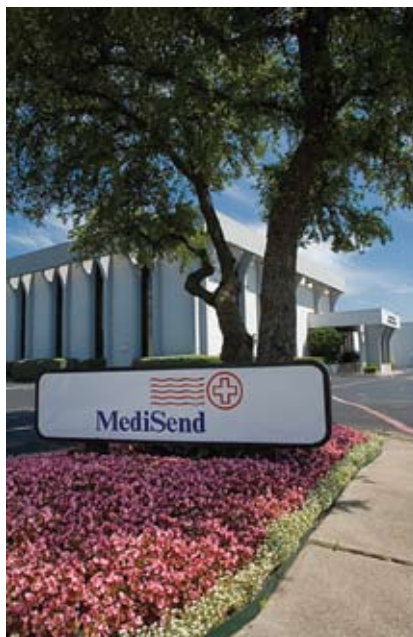
The MediSend International facility in Dallas, Texas, houses the Biomedical Training Laboratory and School as well as warehouse/shipping and administrative offices.