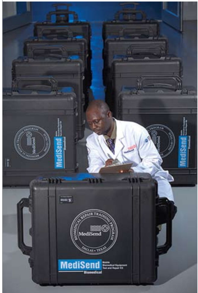
Each trainee's hospital receives the MediSend Biomedical Equipment Test and Repair Kit™.

MediSend has formed partnerships that convenience